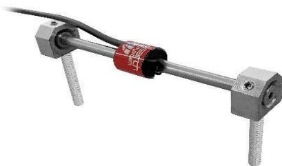
strain gauge with anchoring end blocks for fixing on concrete walls

CE product compliant with European directives