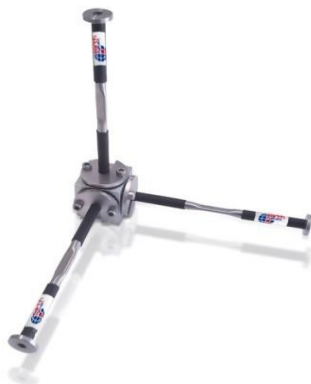
Position of the strain gauge in 3D

CE product compliant with European directives