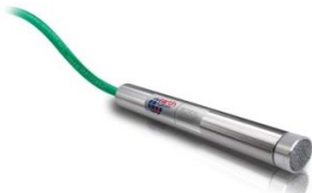
submersible level meter