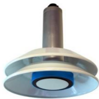
ultrasound level meter

CE product compliant with European directives