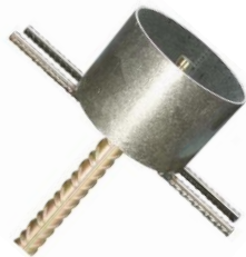
Convergence bolt with protection ring

Various bayonet fittings: ABS flange, ABS or stainless steel M8 male, ABS 5/8 " female.